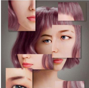
"Take me (apart)"

Fans of Singapore's top virtual influencer Rae get priority notice on Rae's first collectible NFT drops