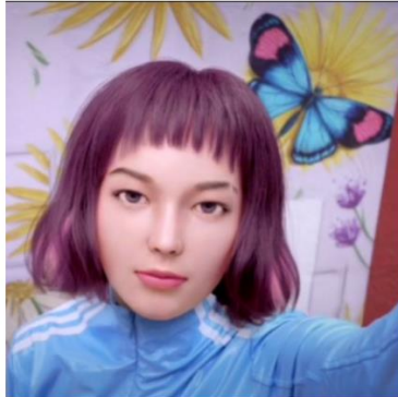
"You lookin' at me?"