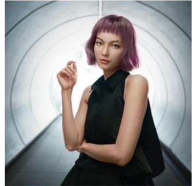
"Welcome to my metaverse"

Singapore, 12 July 2021 – Singapore's top virtual influencer, digital artist and street culture enthusiast, Rae ( @here.is.rae ) with over 495,000 followers on Instagram and Weibo will be the first virtual influencer in Southeast Asia to mint and sell a collectible series of non-fungible tokens 1 (NFTs). The series, titled "TAKE A BYTE" comprises three animated 1/1 NFT artwork featuring Rae's most exciting and well-loved Instagram posts. "TAKE A BYTE" by Rae will be uploaded to Mintable – a popular NFT marketplace headquartered in Singapore. To celebrate the sale of Rae's first NFT drops with her fans, fans can register at hereisrae.com/nft to be notified of the sale and gain access to purchase the NFTs. Registration is open from now till Monday, 19 July 2021, 12.00 pm (GMT +8, Singapore Time).